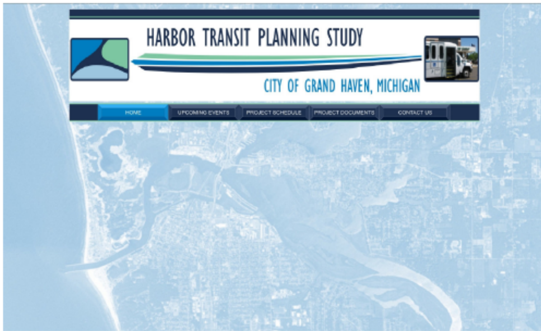
Figure 1 Website Template