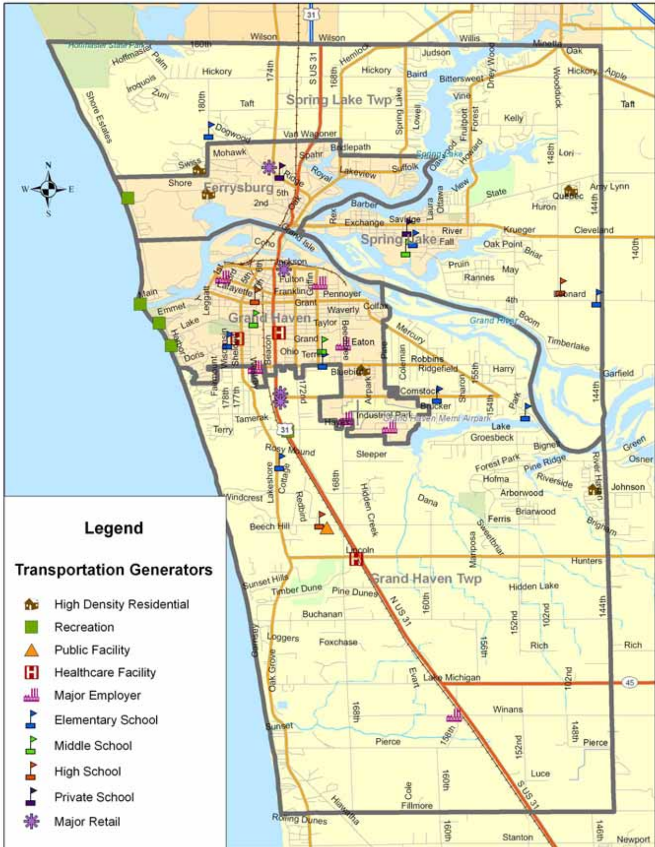
Figure 2-1 Transportation Generators