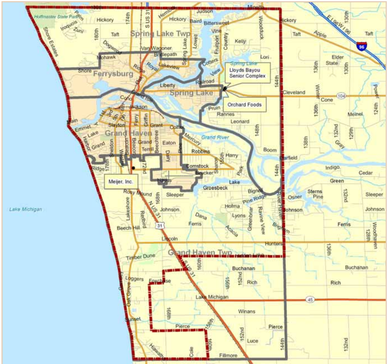
Figure 1-1 Study Area